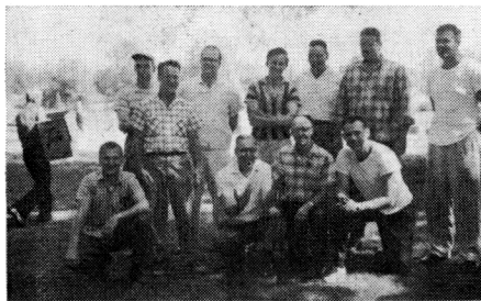
These Men Had "The Pull"

It was only because darkness came upon them that they gathered their things and reluctantly, but happily, departed for home.