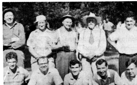
Give A Man Enough Rope —